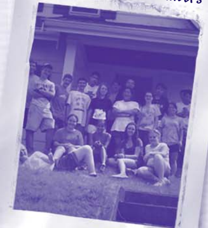
A Group of CHP Volunteers

The Community Development Corporations Association of Greater Cincinnati held its 2010 Annual Award Celebration this past summer to honor the most outstanding community development employees and consultants.